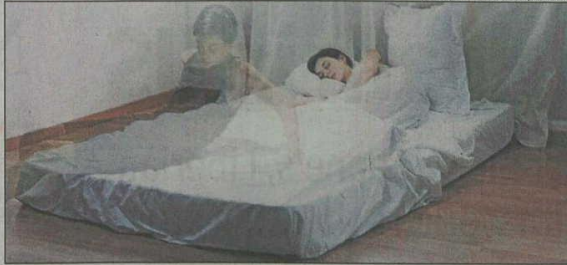
OUT-OF-BODY EXPERIENCE IS REAL?