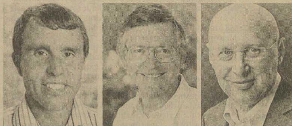
(From left) American scientists Eric Betzig and William Moerner and Germany's Stefan Hell.