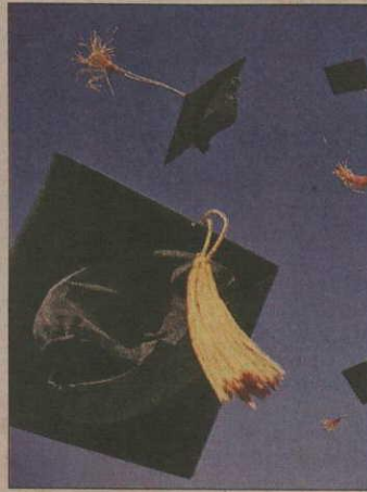
Still all up in the air

We should have more than 700 'degree'-awarding institutions, with a sharp rise in recent years in deemed and private segments. The number of 'colleges' has also increased to almost 35,000 and enrolment in higher education is approaching 20 million. I wish to make a broad point. So